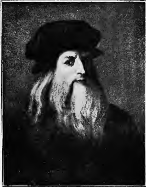
LEONARDO DA VINCI